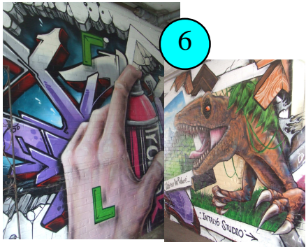
A learner artist in the Intalyo yard, off the High Street