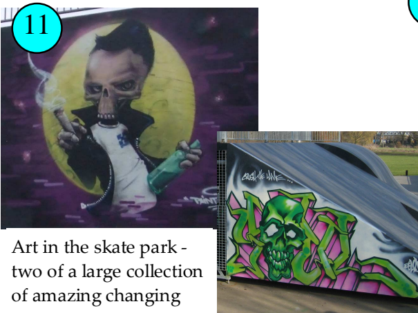
Art in the skate park - two of a large collection of amazing changing murals