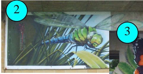
A dragonfly emerging from the town bridge !