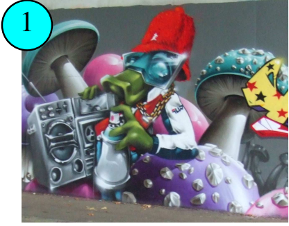
Amazing scenes at the Duloe Underpass

Visit the sites to see the full mural - here is just a peek at some of the amazing talent in the town !