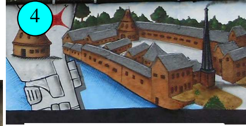
Peer at the Priory Mural behind Cross Keys Mall