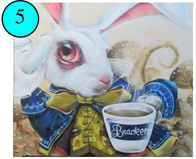
Alice in Wonderland behind Barrett's shop