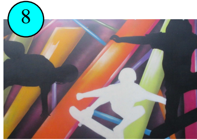
Discover the murals on the railway bridge