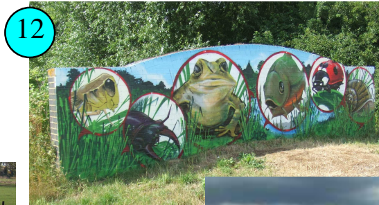
Creatures on the bridge and a bridge with a view !