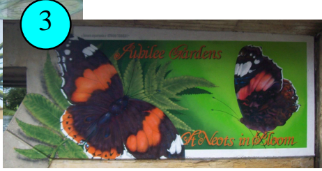
Butterflies on the bridge