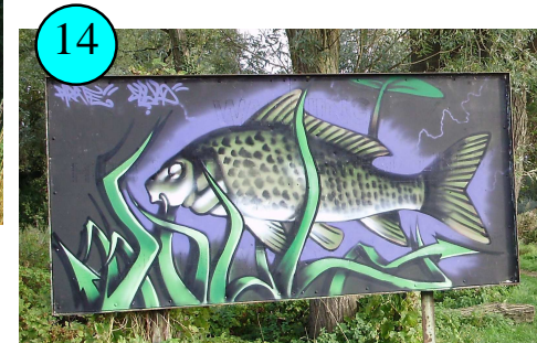
A fish on the river bank—gone in July 2013 but not forgotten- now a blank canvas ready for another inspiring painting !