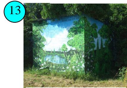
A former pump house on the river