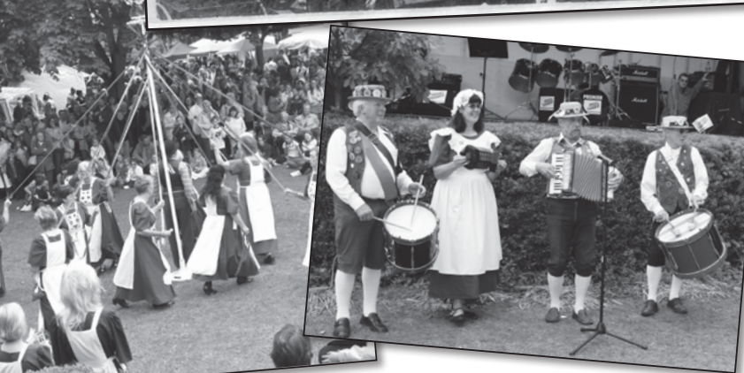
May Day 2007

Sat 3rd May and Mon 5th May St Mary's Church, Eaton Socon 10am – 4pm