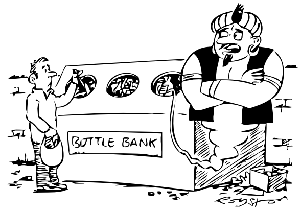
"I'll grant you three wishes if you can get me out of here"

Remember that all profits from the bottle bank are distributed to local organisations right here in Eaton Socon and Eaton Ford. Less bottles means less money to share out!