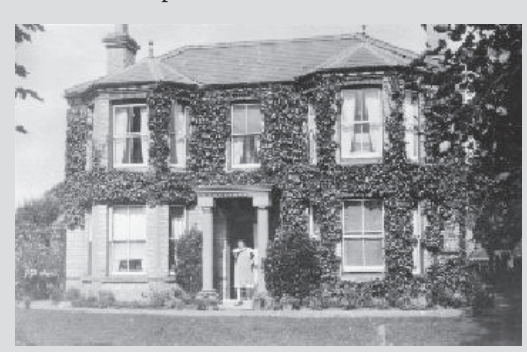
Who lived in this lovely house in 1911

Saturday 30th April and Monday 2nd May 10am – 4pm Local History Exhibition on the 1911 Census, the Eatons, Eynesbury, St Neots and local villages Research local archives for families and buildings. Explore the 1911 Census