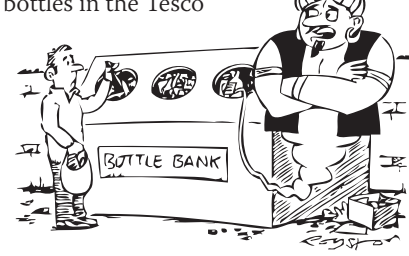
"I'll grant you three wishes if you can get me out of here

Bottles in the Tesco Express Bottle Bank = money for local groups