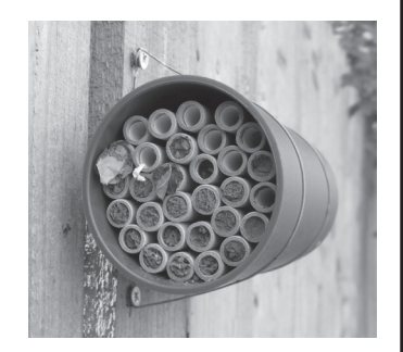
Oxford Bee Company's solitary bee nesting box showing two different chamber seals, mud

More successful was the trial of solitary bee nest boxes at Sudbury Meadow, sponsored by St Neots in Bloom. Three commercially available boxes and two home made ones, were mounted on a suitable east-facing fence. The two commercial boxes using cardboard tubes were definitely the most successful (available mail order). Several different species of bee used the boxes, some of which