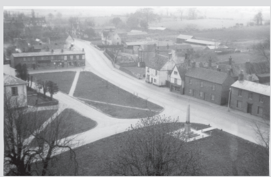
View of Eaton Socon from the church tower in 1956

'Then and Now' Local History Exhibition Launch of new book 'The Eatons Then and Now' Research local archives for families and buildings Explore the 1911 Census