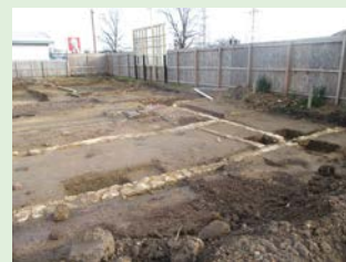
Foundations of former cottages on the new Lidl site in Eaton Socon

The 'Men of Dover in Wyboston' – and their link with the Paper Mill in WW2 in Little Paxton. After a successful get together of some of the families last year more information was gathered for a larger exhibition this year.