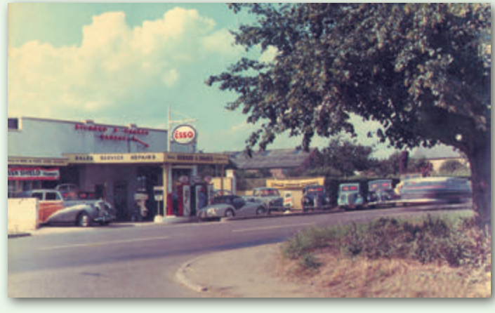
If you have any photographs you wish to send to ESCA please see the email address inside the front cover. We are always pleased to see new pictures of the past.

in this picture was in the garden of a large house, called 'The Beeches.' This picture will soon be on a new ESCA website and has already been added to the St Neots archive website – www.st-neots.ccan.co.uk