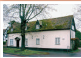
Avenue Farm in Eaton Ford