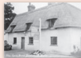
Gery Arms, Bushmead